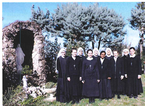
Novices and Postulants

The Consoling Sisters of the Sacred Heart want to spread Christ's reign in the world by living their motto: " Heart of Jesus, to love Thee and to make Thee loved ".